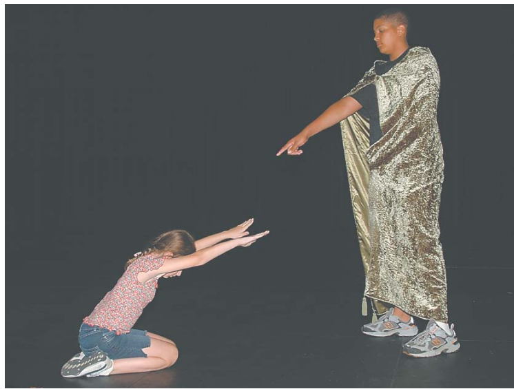
Two actors rehearse in theater camp.